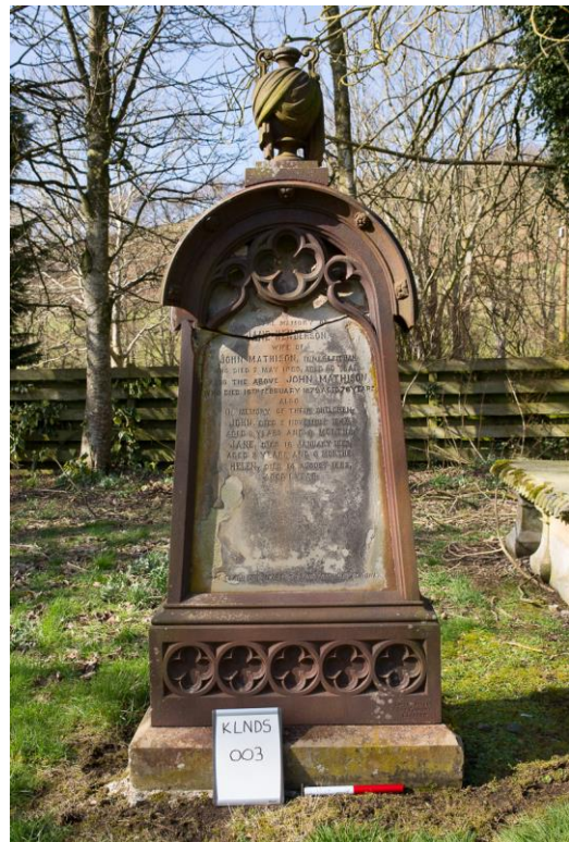
Unusual cast iron memorial with “draped urn” feature

Currently, the surveyors are in the process of recording details of the individual gravestones.