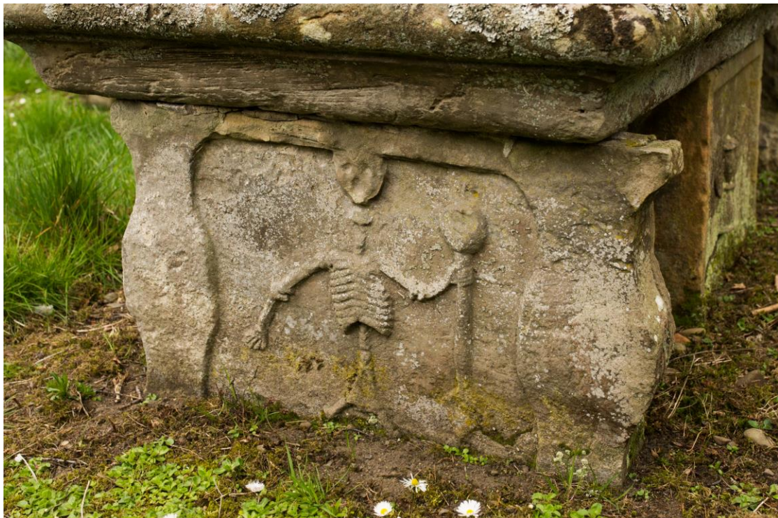
Table tomb showing “symbols of mortality”