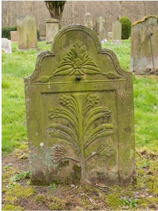
Gravestone showing “Tree of Life” motif

Although the recording work is not yet complete, the survey has already uncovered a great deal about how the people of Innerleithen lived in the past.