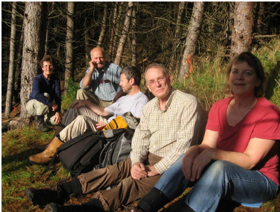
The Camp Shiel Team!

What was happening during this period? The 14 th century was a turbulent time in Scotland particularly in the Lowlands which had been largely occupied by the English at the end of the 13 th century. Robert the Bruce fought hard and succeeded in regaining much of the country, unifying it in the process.